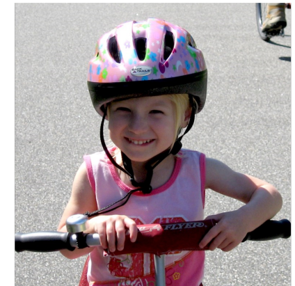
...One Very Happy Trail User...