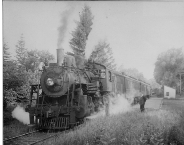
BOSTON & MAINE RAILROAD PASSENGER TRAIN PREPARES TO LEAVE TOPSFIELD WITH MORNING COMMUTERS IN 1946. LOCOMOTIVE IS A 2-6-0 (MOGUL) TYPE #1464, BUILT IN 1909. NOTE TINY STATION IN RIGHT BACKGROUND WHICH REPLACED THE BIG STATION WHICH ONCE STOOD ON THIS PARK ST. SITE. STEAM IS POPPING OFF AND THE CONDUCTOR IS READY TO CALL, "ALL ABOARD".

FOR OVER 100 YEARS THE RAILROAD TRANSPORTED WORKERS, BUSINESS MEN, LEISURE TRAVELERS AND FREIGHT TO AND FROM TOPSFIELD FROM SURROUNDING TOWNS AND BOSTON. THE LAST PASSENGER TRAIN TO TOPSFIELD RAN ON APRIL 27, 1969, WITH ABOUT 300 PASSENGERS ON BOARD. THE LAST FREIGHT TRAIN LEFT IN 1977. BY 1981 THE LINE HAD BEEN FORMALLY ABANDONED AND TRANSFERRED TO THE MASSACHUSETTS BAY TRANSIT AUTHORITY (MBTA).